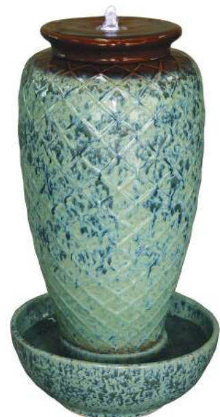
55031 Cross Hatch Jar – Distressed Aqua