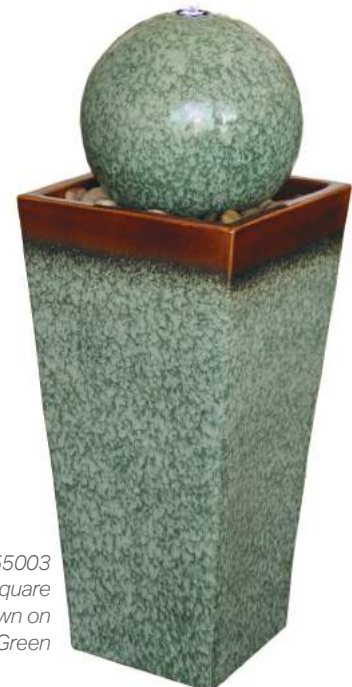
55003 Square Brown on Marble Green