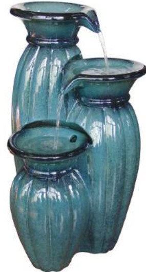
55013 Tall Jar – Aqua Blue