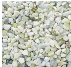
2802654 Jade Bean