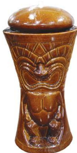
55036 Tiki Head – Dark Honey