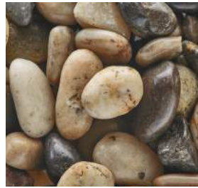
2802649 Polished Mix