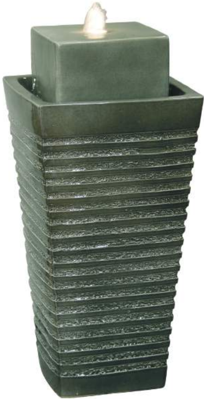
55069 Tall Ripple Square – Dark Moss Green