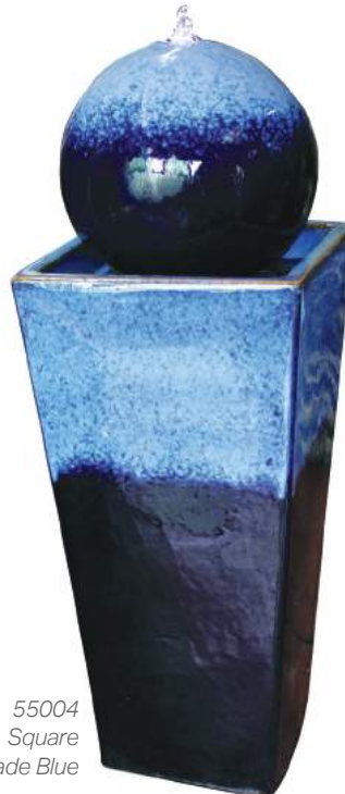
55004 Square Cascade Blue