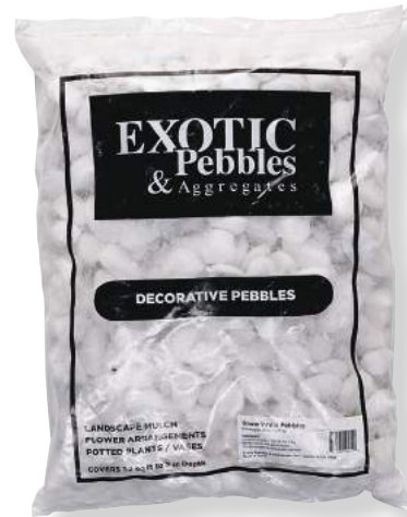
20 Lb Bag