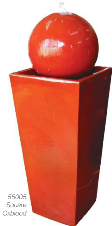
55005 Square Oxblood