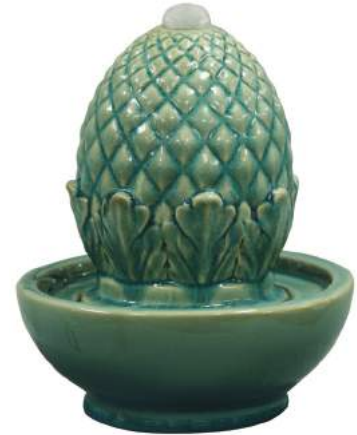
Pineapple Tabletop – Dark Honey