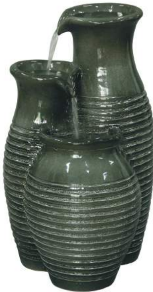
55071 3 Tier Tall Ripple – Dark Moss Green