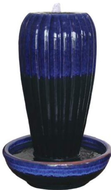
55030 Tall Ribbed – Cobalt/Black