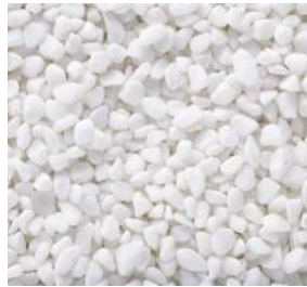
2802653 White Bean