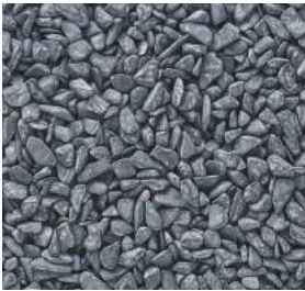
2802652 Black Bean