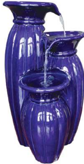
55015 Tall Jar – Cobalt