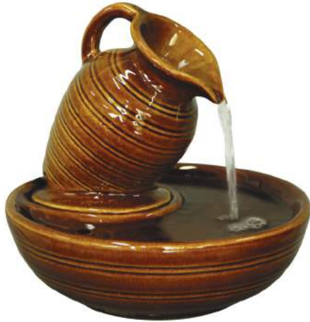
55066 Tabletop Jug – Dark Honey