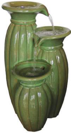
55014 Tall Jar – Wasabi