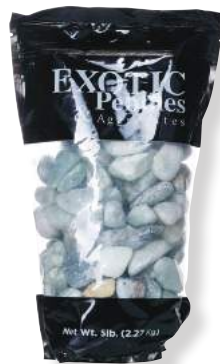
5 Lb Bag