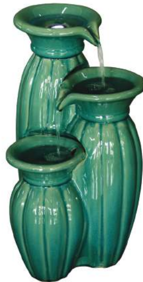
55035 Tall Jar – Caribbean Green