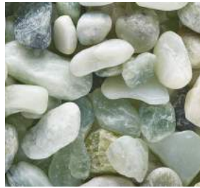
2802644 Polished Jade