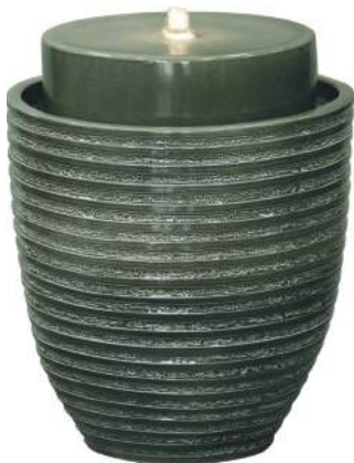
55070 Tall Ripple Egg – Dark Moss Green