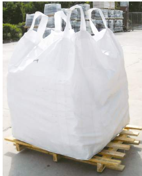
Super Sack - 50 x 20kg Bags