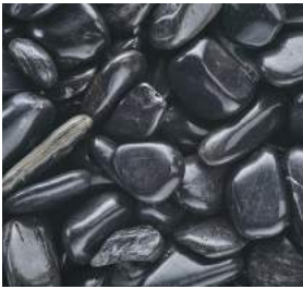
2802643 Polished Black