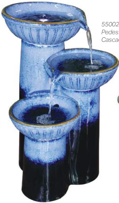
55002 Pedestal Cascade Blue