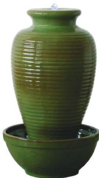
55037 Rippled Jar – Moss Green