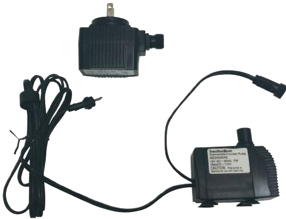
55021 / 55022 / 55023