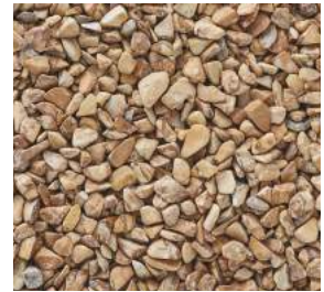
2802655 Wood Bean