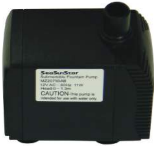
55024 / 55020