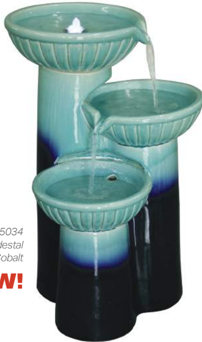
55034 Pedestal Jade/Cobalt