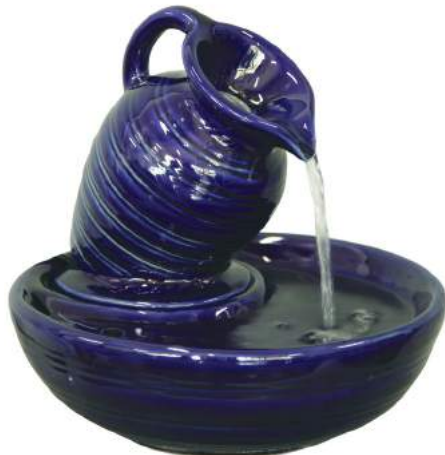
55068 Tabletop Jug – Cobalt