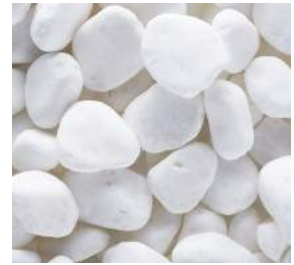
2802650 Natural Snow White