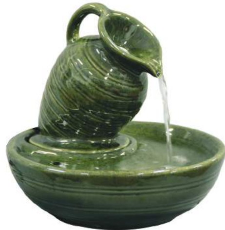
55067 Tabletop Jug – Marble Green