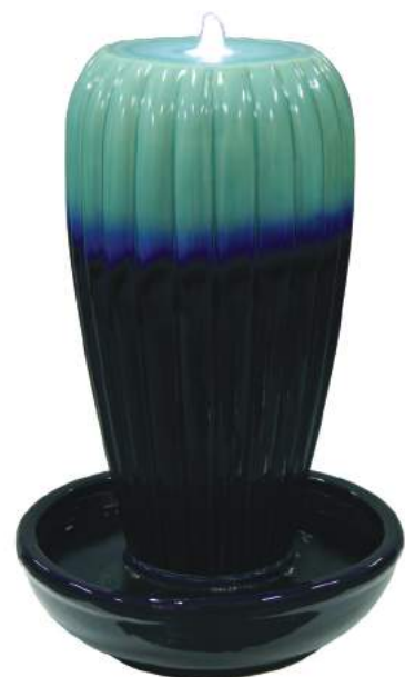
55032 Tall Ribbed – Jade/Black