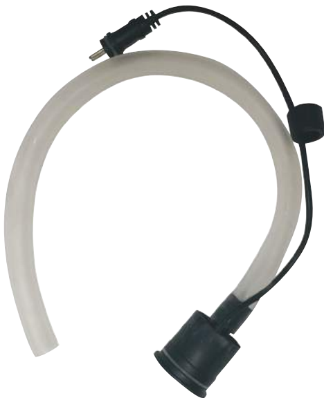
55025 / 55026 / 55027 / 55028 / 55029